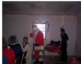
Sunnyside Volunteer Christmas Party, 2005

Is it not to share your food with the hungry and to provide the poor wanderer with shelter when you see the naked, to clothe him, and not to turn away from your own flesh and blood?